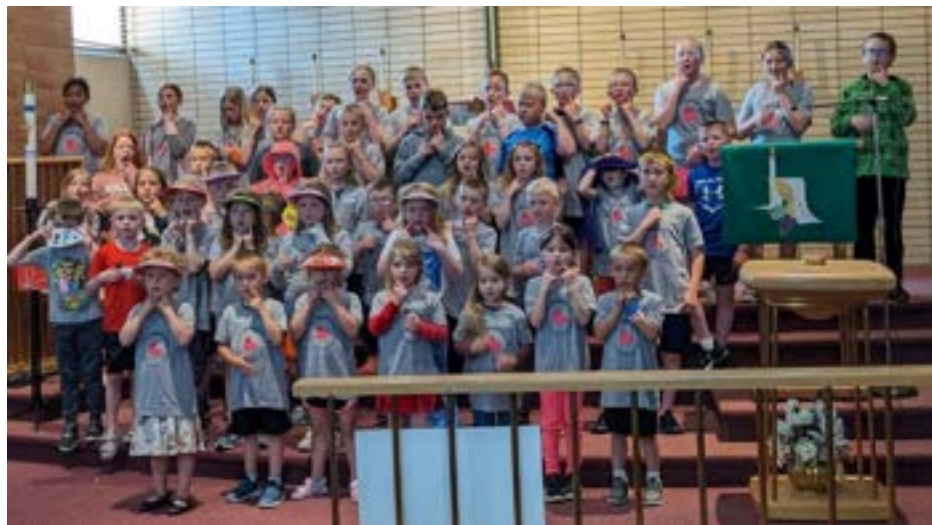
All 2024 VBS children singing

Hosted by Our Saviors' Lutheran Church and UCC