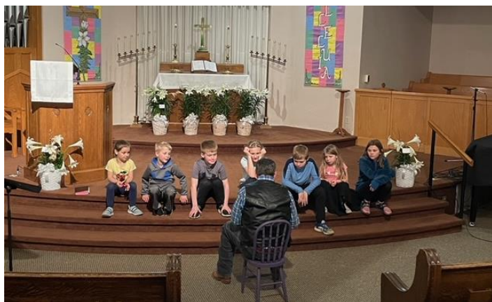
Time for Children on Wed. April 10